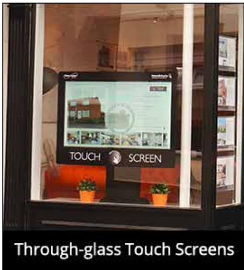
Through-glass Touch Screens