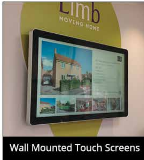
Wall Mounted Touch Screens